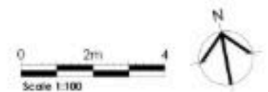
PROPOSED HOUSE 1