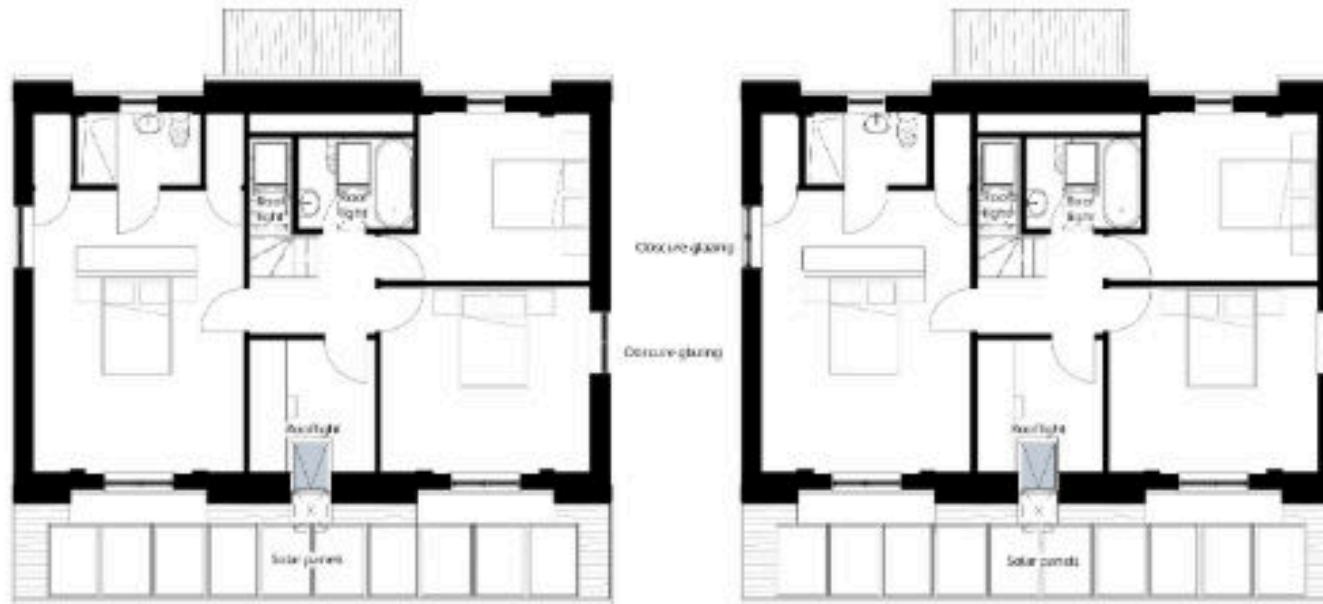
PROPOSED HOUSE 2